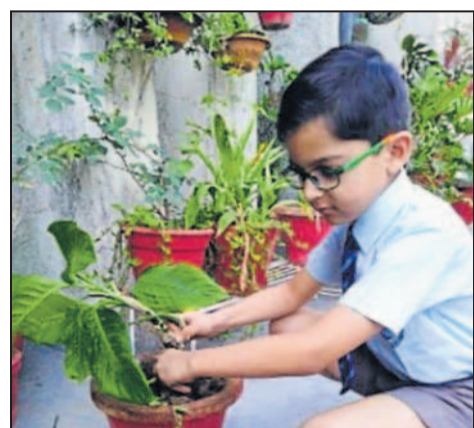
Students are keeping themselves busy in diverse activities such as gardening, cooking

Amid the Covid-19 lockdown period, 'Stay Home, Stay Empowered' is the mantra being followed by the students and teachers of Apeejay School, Faridabad. The lockdown has opened many unforeseen opportunities for everyone. The students are skillfully re-scripting their schedule and finding innovative ways to make the most of trying times. They are spreading cheer among their families. From photography to gardening and from yoga to cooking, they are experimenting with fun to create happy memories to last a lifetime. They are keeping themselves busy in diverse activities such as learning a musical instrument, enhancing command over a language and technology and packaging meals for the underprivileged etc. Grandparents and parents are a constant source of support and strength for them during the pandemic.