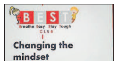
Students took a pledge to clean the air with the help of BEST Clubs

students in the previous session was also screened. The awards were displayed with the photographs and names of the awardees along with their achievements. The scholar badge ceremony of the senior school also witnessed students being honoured with awards.