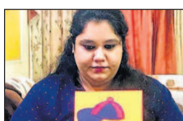
The teachers make the online classes interesting for students

GD Goenka Public school, Dwarka, takes pride in its principle that the fundamental motive of holistic development of students has always been the cornerstone of its strong educational policy. Undeterred by the pandemic, the school has left no stone unturned in facilitating the online teaching process. The teachers themselves became learners and overcame the obstacles of technology to make online classes interesting for students. Be it making PPTs, videos or interactive sessions or telephonic 'care calls', to find out about the well-being of students