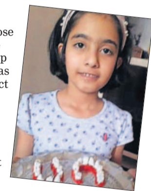
A glimpse of the event

Ryan International School, Sector 40, Gurugram, recently conducted an activity on human teeth wherein a teacher explained to students about various types of teeth and their functions. The students were asked to make a set of milk teeth and another set of permanent teeth by using clay dough and wheat flour dough. Then they fixed those teeth into the gums made up of red dough as per the correct placement of teeth. The activity was informative and students took part in it with zeal.