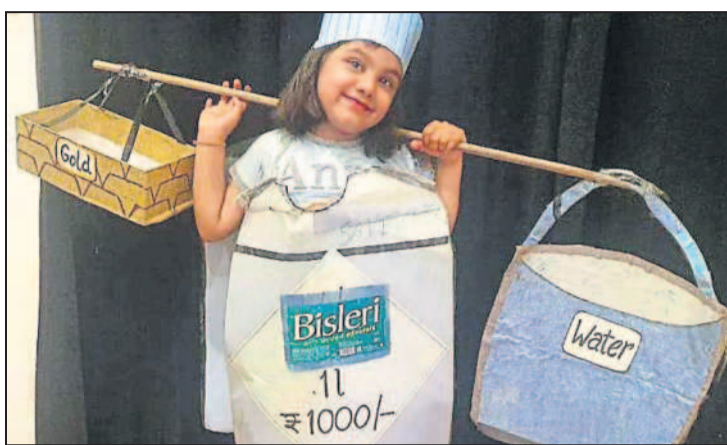
Students virtually narrated motivational stories